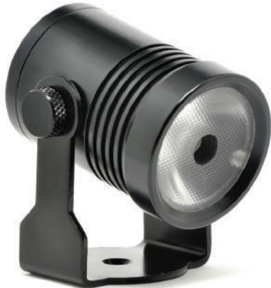
Gantom DMX Spotlight