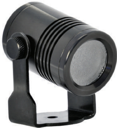
Gantom DMX Floodlight