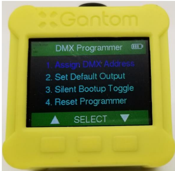
Figure 1: Main menu screen

To power on the device , press the power button on the left side of the device. The location of this button is shown in the diagram earlier in this document. To power off the device , press the power button twice quickly.