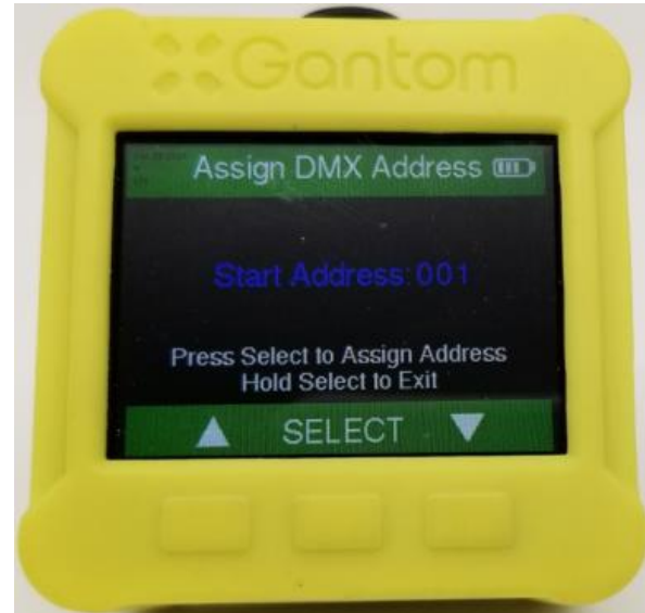
Figure 2: Assign DMX address screen

The main menu for the device is shown in Figure 1 above. You can navigate this menu using the left and right buttons and select the highlighted function using the center button. Here are details for each of these functions: