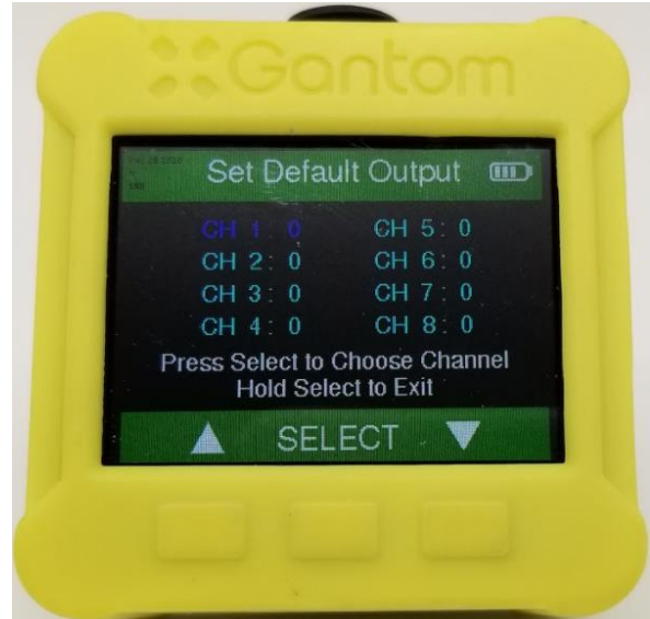
Figure 4: Set default output screen