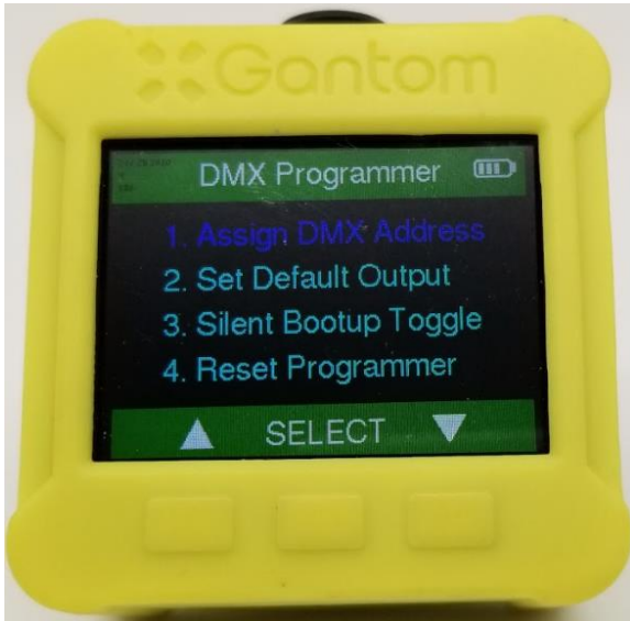
Figure 3: Main menu screen