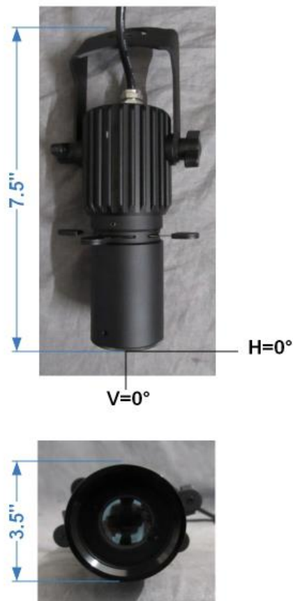
FIG. 1 LUMINAIRE