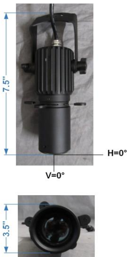
FIG. 1 LUMINAIRE