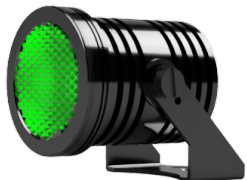
Shown with included Hex Filter

Gantom One Up is backed by Gantom's two year warranty. Special orders and Stucchi track options available. Please contact Gantom at sales@gantom.com for more information.