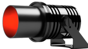
Shown with optional FA44- Top Hat