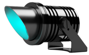
Shown with optional FA46 - Angled Cowling